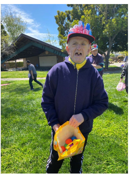
(Adaptive Rec Egg Hunt)